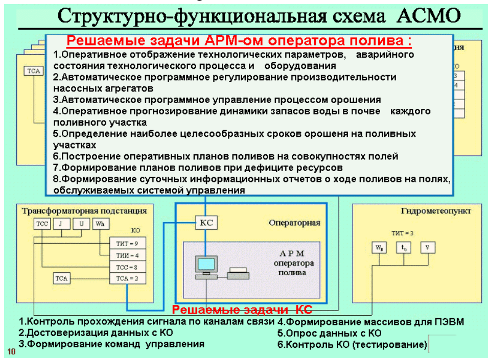
Figure1. Structural and functional diagram of the industrial control system for irrigation.

The structural-functional diagram of the industrial control system and the automatic control system of irrigation developed by us is shown in Fig. 1 and 2.