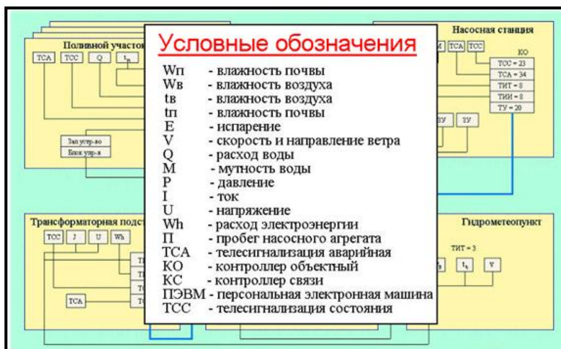
Figure4. Structural and functional diagram of industrial control system for irrigation

For the control and management of power supply facilities ASMO and metering of power consumption at the transformer point (TP) (see the structural and schematic diagram of the automatic process control system of irrigation) transducers are installed: