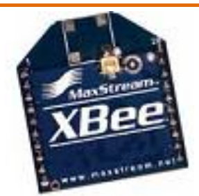
Fig2. Zigbee module

Zigbee is the product of the Zigbee Alliance, an organization of manufacturers dedicated to developing a new networking technology for small, ISM-band radios that could welcome even the simplest industrial and home end devices into wireless connectivity ZigBee uses a basic master-slave configuration suited to static star networks of many infrequently used devices that talk via small data packets. It allows up to 254 nodes. Bluetooth's protocol is more complex since it is geared towards handling voice, images and file transfers in ad hoc networks. Bluetooth devices can support scatter nets of multiple smaller non-synchronized networks (piconets). It only allows up to 8 slave nodes in a basic master-slave piconet.