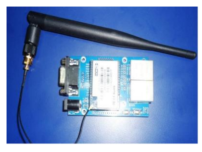
Fig5. Wi-Fi Module

The Graphical User Interface is used to display the data in an understandable format and is also shown using graph.