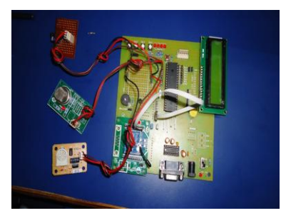
Fig4. Sensor Node

The sensor node is having the sensors of humidity, temperature and gas sensor. The sensor data is displayed on the LCD.