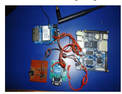
Fig3. Receiver Node

The receiver node is developed on the ARM9 based S3C2440 micro controller. For data receiving from sensor node we are using zigbee module. For long range data transmission we using Wi-Fi.