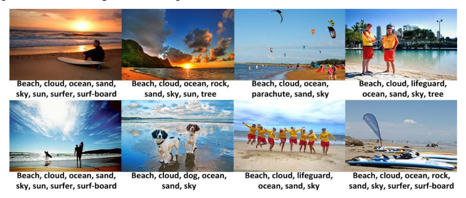
Fig1. Internet images with multi-label characteristic. Pair-wise and higher order label correlations are manifest, and crucial to efficient image classification.

The supervised learning techniques to image classification problems is that it is required large amount of labeled training images. The unlabeled images are easily available, where as annotation is expensive or time consuming. Active learning is worked in an iterative fashion. takes traditional binary myopic active learning as an example.